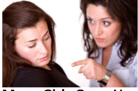
Mean Girls Grow Up

Supporting Victims of Bullying in the Workplace